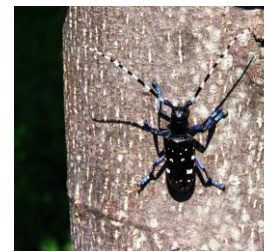
Right: Asian longhorned beetle up close.